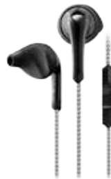
SIGNATURE SERIES IX-3000

TRY THESE NEW PRODUCTS WITH ADDITIONAL FEATURES.